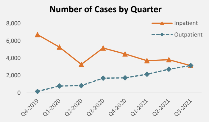
Q4-2019 through Q3-2020 inpatient and all outpatient data are displayed for trending purposes only and are not included in the report analyses. Q2-2020 data was impacted by the COVID-19 pandemic.

This report examines the 15,170 inpatient hospitalizations for total hip replacement surgery performed in Pennsylvania acute care hospitals from October 1, 2020 through September 30, 2021.